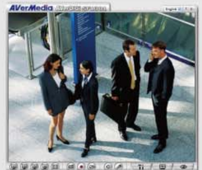
Bundled with exclusive AVerDiGi Web Browser